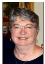
ANN KROMHOUT PUBLICATIONS